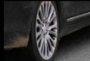
2014 Black Buick LaCrosse

This vehicle has been known to use multiple license plates, to include the below listed plates.