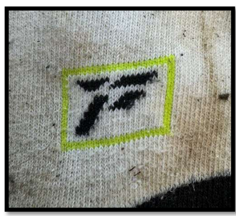
Sock recovered from remains